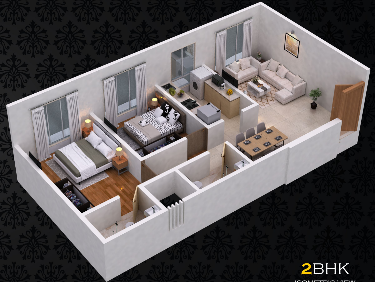
2 BHK ISOMETRIC VIEW