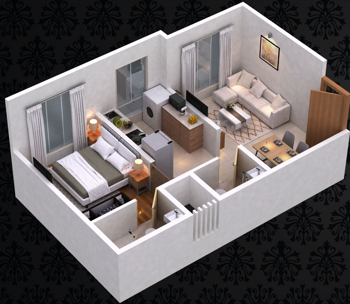
1 BHK ISOMETRIC VIEW

THOUGHTFULLY DESIGNED, METICULOUSLY PLANNED WITH ARRAY OF LUXURY AMENITIES.